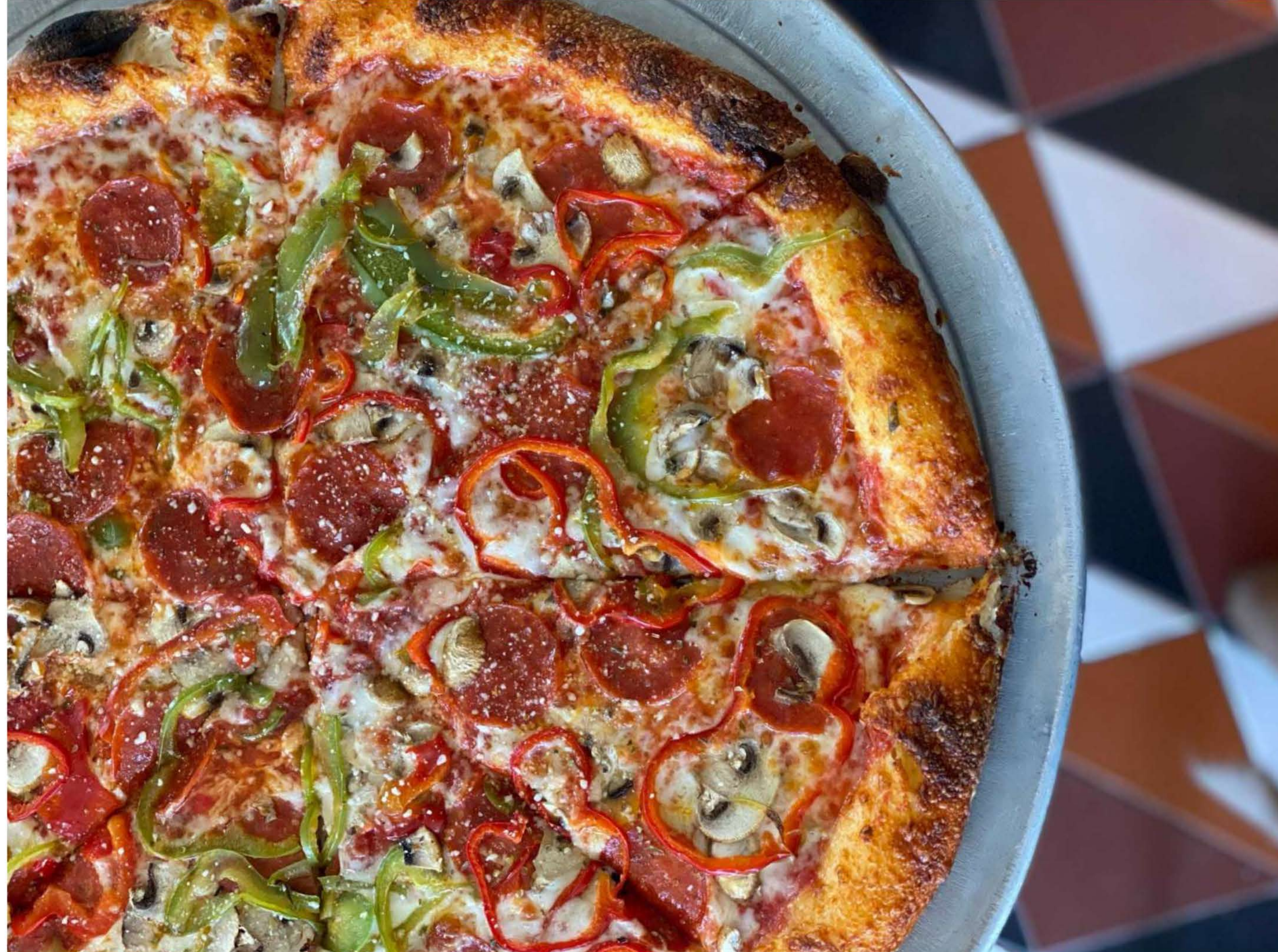
The second Little Original Joe's location in the Marina will also serve pizza.

The longtime Original Joe's family of restaurants is growing, with two San Francisco additions: an Italian spin-off in the Marina and a Mexican restaurant in West Portal.