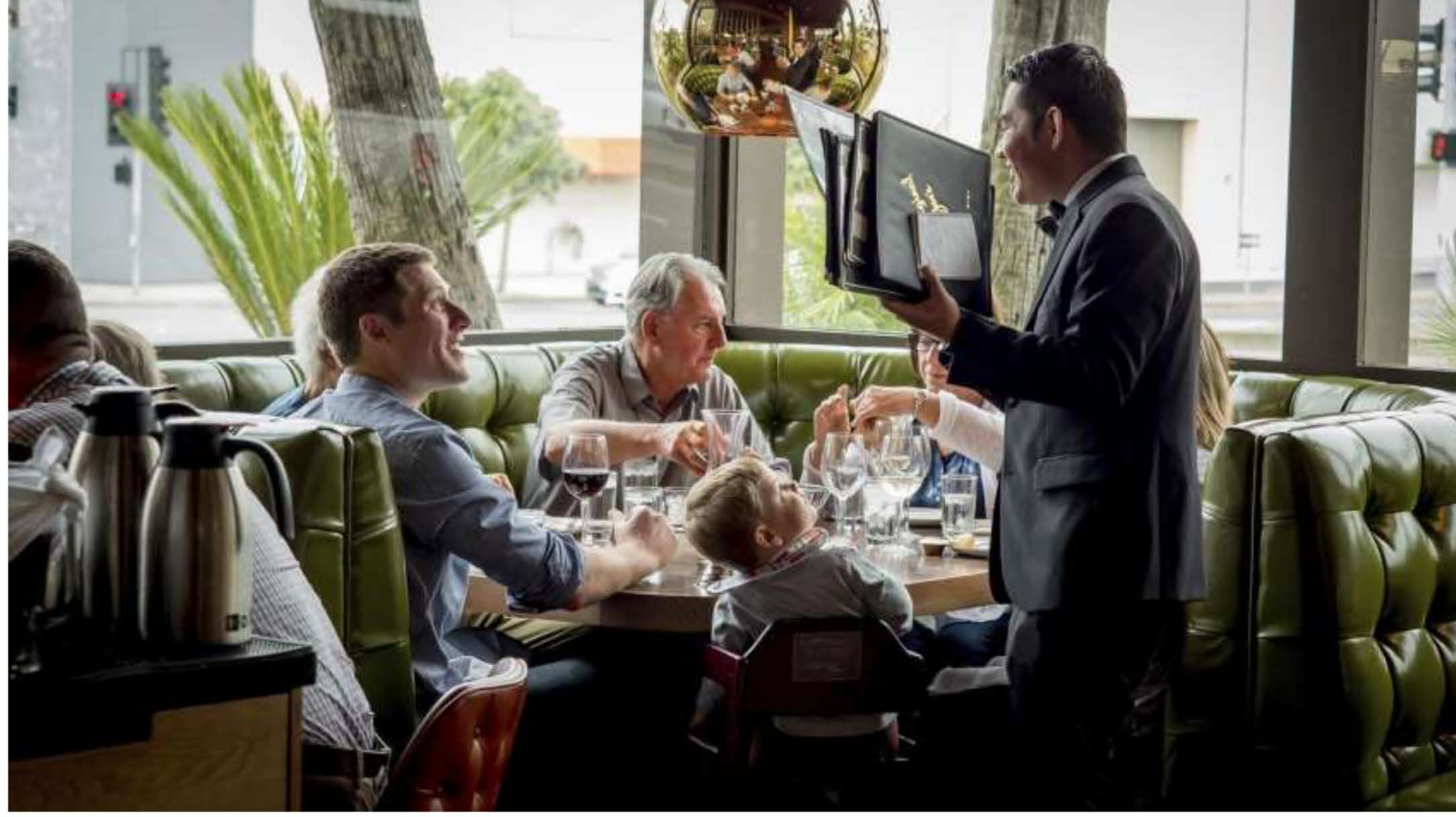
Patrons dine at Original Joe's of Westlake in Daly City in 2016. The owners are planning another spin-off of their North Beach restaurant as well as a Mexican restaurant called Elena's.