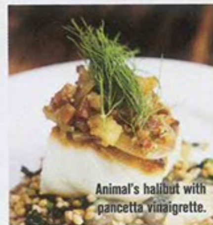
Animal's halibut with pancetta vinaigrette.