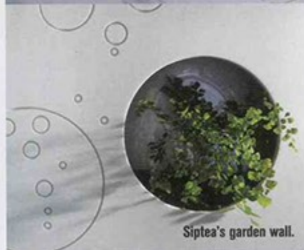
Siptea's garden wall.